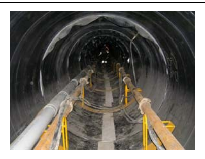
b. Slurry pipes & lubrication lines